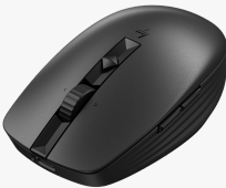
HP 710 Rechargeable Silent Mouse 6E6F2AA