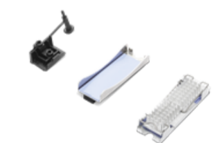
ThinkCentre M.2 2280 SSD Kit III