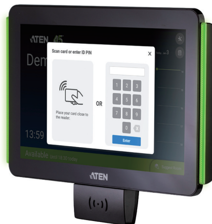
VK430 + VK401