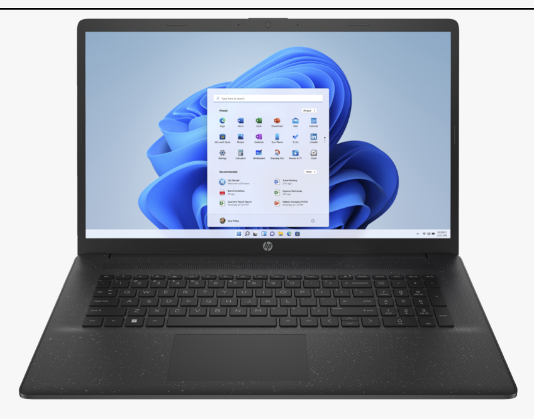
*Toote pilt võib tegelikust tootest erineda

The HP 17.3" Laptop PC is thoughtfully designed. Experience reliable performance with an Intel® Processor<sup>1</sup>, fast Wi-Fi, and plenty of storage. We've got your back with a 17.3" screen with narrow bezels, enlarged clickpad and a lift-hinge design. Plus, it's EPEAT® Gold registered<sup>2</sup> and ENERGY STAR® certified and contains post-consumer recycled plastics<sup>3</sup>.