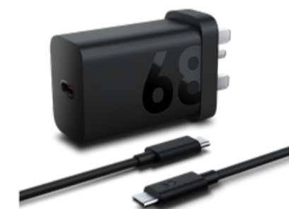
Lenovo 68W USB-C Wall Charger