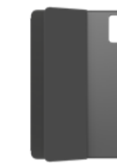
Lenovo Folio Case for Tab K11 Plus