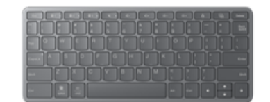
Lenovo Multi-Device Wireless Keyboard