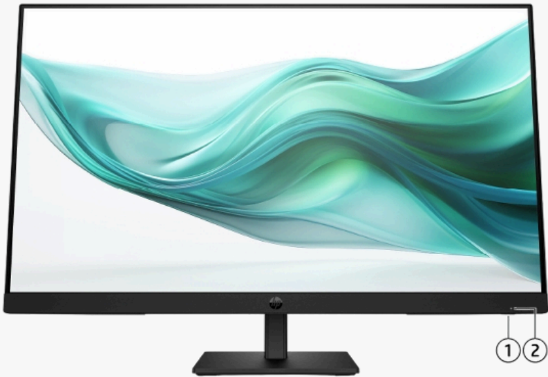
1. Power button