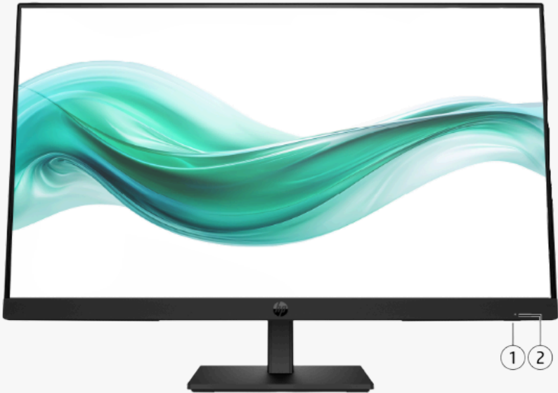
1. Power button