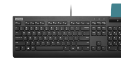
Lenovo Smartcard Wired Keyboard II-UK English