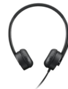
Lenovo Essential Stereo Analog Headset