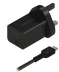
Lenovo GaN Nano 65W Adapter