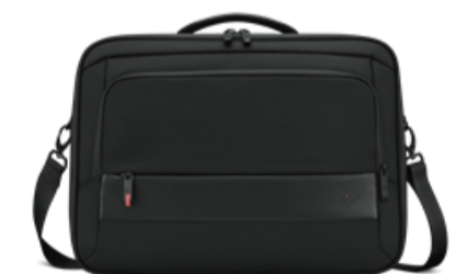
ThinkPad Professional 16-inch Topload Gen 2