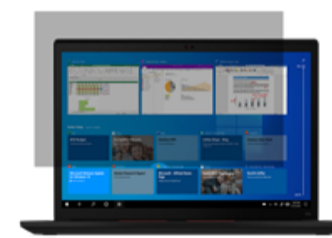
Lenovo 13.3-inch Bright Screen Privacy Filter for X13 Gen2 from 3M