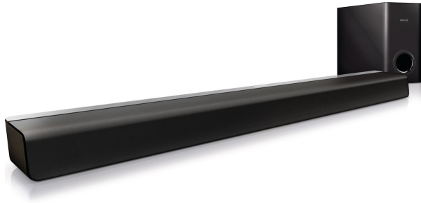
SoundBar Home cinema speakers