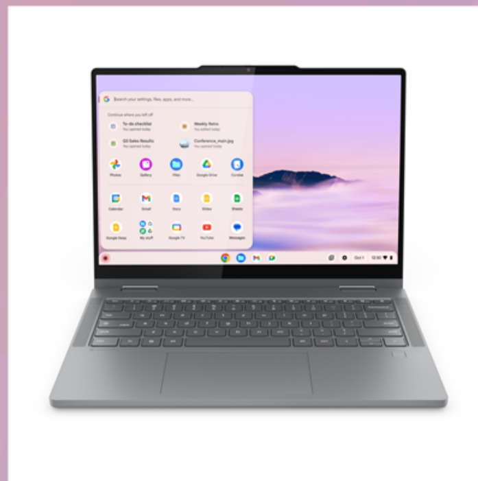
The product images are for illustration purposes only. Actual product appearance, ports, keyboard layout, and accessories may vary by model.