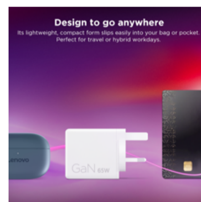
Lenovo Dual USB-C 65W GaN Charger