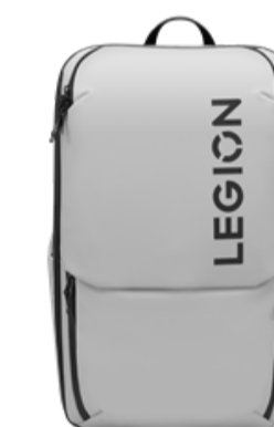
Lenovo Legion 17" Gaming Backpack GB800 (Light Gray)