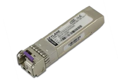
Figure 1. SFP Single Fiber (non-binding illustration)