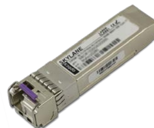
Figure 1. SFP Single Fiber (non-binding illustration)