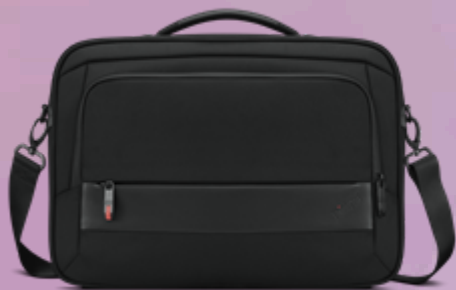
ThinkPad Professional 14-inch Topload Gen 2 4X41M69796

Please click here to view the full list of accessories.