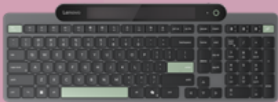
Lenovo Self-Charging Bluetooth Keyboard-French Canadian 058 4Y41R69498