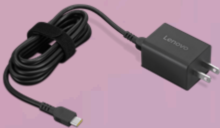
Lenovo GaN Nano 65W Adapter 40AWGN65US