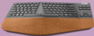
Lenovo Go Wireless Split Keyboard-US English 4Y41R64755

Please click here to view the full list of accessories.