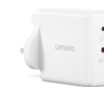
Lenovo Dual USB-C 65W GaN Charger