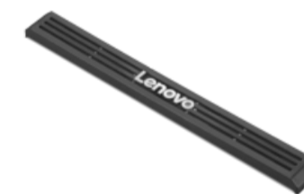
ThinkCentre Tiny Dust Shield Gen6