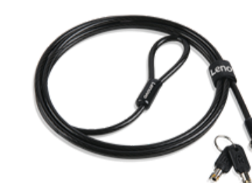
Kensington MicroSaver DS 2.0 Cable Lock from Lenovo