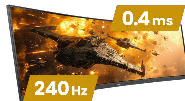
240Hz & 0.4ms MPRT

The 1500R curvature of the screen guarantees a realistic and comfortable viewing experience allowing you to really immerse yourself in the game.