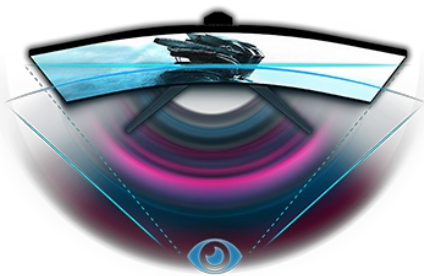
CURVED DESIGN 1500R

Seamlessly switch between work and play with the built-in KVM function, allowing you to control multiple devices with a single set of peripherals. Additionally, the monitor features both Picture-in-Picture (PiP) and Picture-by-Picture (PbP) functions, enabling efficient multitasking and boosting productivity.