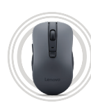
Lenovo WL310 Bluetooth® Silent Mouse