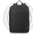
Lenovo 15.6" Laptop Backpack B210