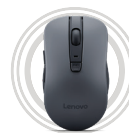
Lenovo WL310 Bluetooth® Silent Mouse