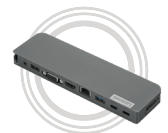
Lenovo USB-C Mini Dock