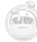
Lenovo E310 True Wireless Stereo Earbuds