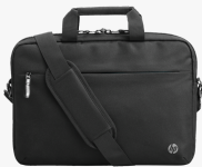
HP Professional 14.1-inch Laptop Bag 500S8AA