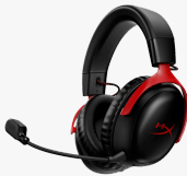
HyperX Cloud III Wireless - Gaming Headset 77Z46AA