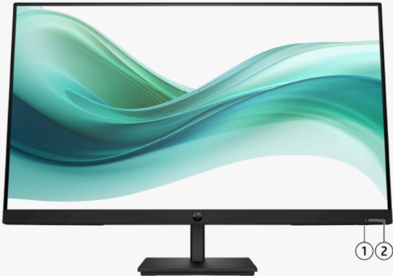
1. Power button