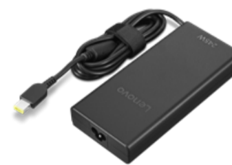
Lenovo 245W AC Adapter (Slim tip)-UK