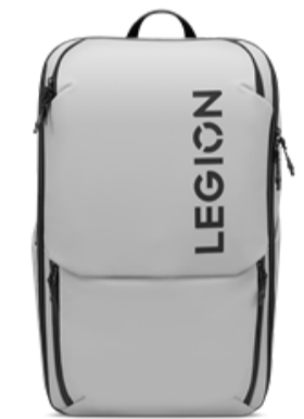
Lenovo Legion 17" Gaming Backpack GB800 (Light Gray)