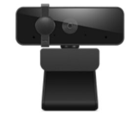
Lenovo 310 FHD Webcam Black