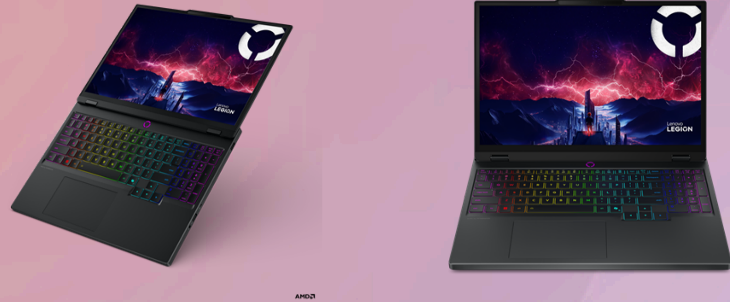
The product images are for illustration purposes only. Actual product appearance, ports, keyboard layout, and accessories may vary by model.