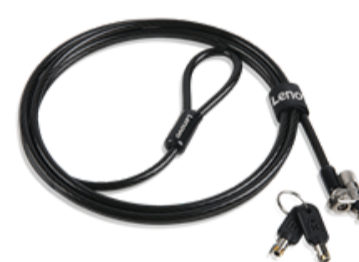
Kensington MicroSaver DS 2.0 Cable Lock from Lenovo