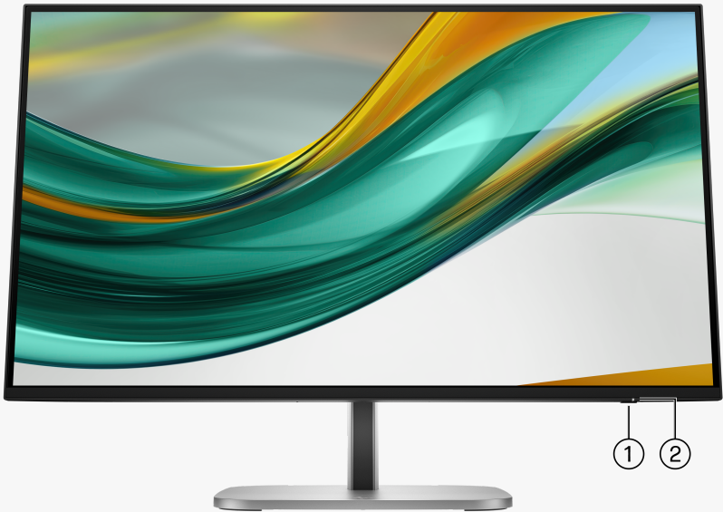
1. Power button