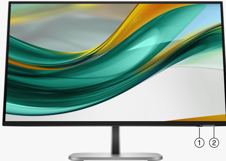
1. Power button