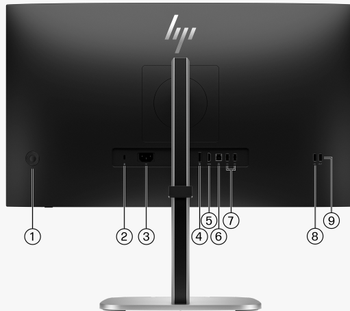
2. Power LED