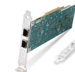
Intel E810-DA2 10/25GbE SFP28 2-Port PCIe Ethernet Adapter