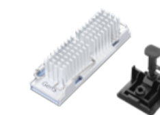
ThinkStation Heatsink Kit for PCIe Gen5 M.2 SSD - P3 TWR G2