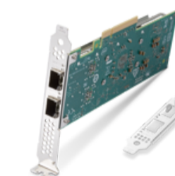
Intel E810-DA2 10/25GbE SFP28 2-Port PCIe Ethernet Adapter