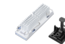
ThinkStation Heatsink Kit for PCIe Gen5 M.2 SSD - P3 TWR G2