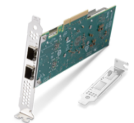
Intel E810-DA2 10/25GbE SFP28 2-Port PCIe Ethernet Adapter