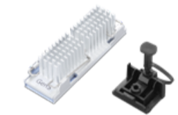
ThinkStation Heatsink Kit for PCIe Gen5 M.2 SSD - P3 TWR G2