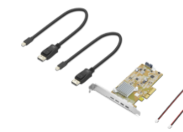
ThinkStation USB4 Dual Port PCIe Card