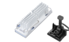
ThinkStation Heatsink Kit for PCIe Gen5 M.2 SSD - P3 TWR G2