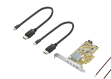
ThinkStation USB4 Dual Port PCIe Card