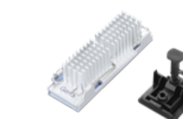
ThinkStation Heatsink Kit for PCIe Gen5 M.2 SSD - P3 TWR G2