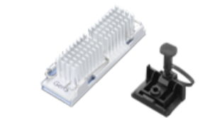
ThinkStation Heatsink Kit for PCIe Gen5 M.2 SSD - P3 TWR G2