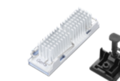
ThinkStation Heatsink Kit for PCIe Gen5 M.2 SSD - P3 TWR G2