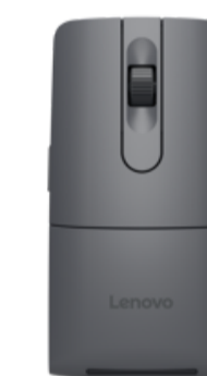
ThinkPad Bluetooth Presenter Mouse (Aura Edition)