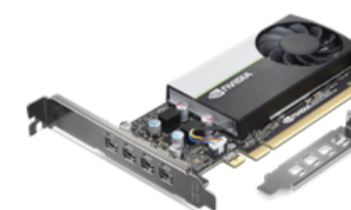
NVIDIA T1000 8GB 4xDP Graphics Card Bulk Pack (40 orders per pack)