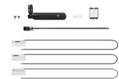
ThinkStation Intel Wi-Fi AX211 WLAN Module - P3