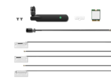
ThinkStation Intel Wi-Fi AX211 WLAN Module - P3