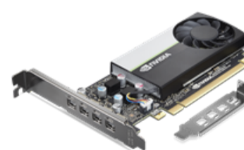
NVIDIA T1000 8GB 4xDP Graphics Card Bulk Pack (40 orders per pack)