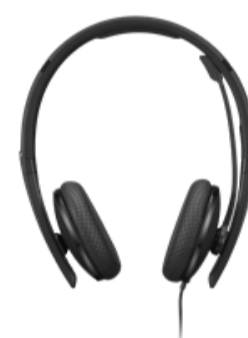
Lenovo Wired VoIP Headset (Teams)