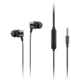
Lenovo Analog In-Ear Headphones Gen II Bulk Package (20pcs)