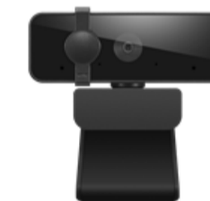
Lenovo 310 FHD Webcam Black