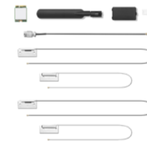
Intel Wi-Fi 7 BE200 WLAN Module