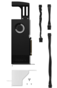
NVIDIA RTX PRO 4000 Blackwell 24GB DP*4 GDDR7 Graphics Card