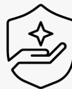
3-year return to depot U4810E