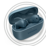
Yoga TWS Earbuds (optional)