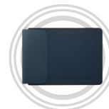
Yoga 14-inch Sleeve (optional)