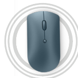
Yoga 14-inch Sleeve