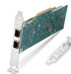
Intel E810-DA2 10/25GbE SFP28 2-Port PCIe Ethernet Adapter