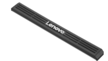
ThinkCentre Tiny Dust Shield Gen6