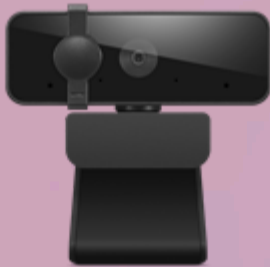
Lenovo Essential FHD Webcam Gen2 4XC1S15018

Please click here to view the full list of accessories.