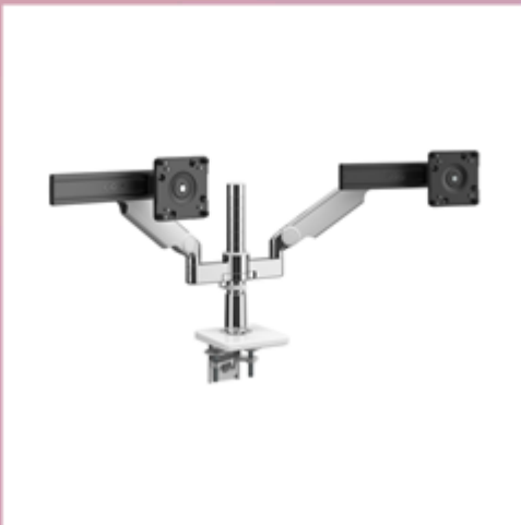
Humanscale Dual Monitor Arm White 4ZE1U10767

Lenovo may not offer the products, services or features discussed in this document in all regions. Lenovo may withdraw an offering at any time. Consult your local representative for information on offerings available in your area. Lenovo reserves the right to change specifications or other product information without notice. Lenovo is not responsible for photographic or typographical errors. Lenovo provides this publication "as is" without warranty of any kind, either express or implied, including the implied warranties of merchantability or fitness for a particular purpose.