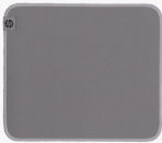
HP 100 Sanitizable Mouse Pad 8X594AA