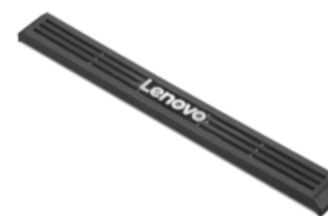
ThinkCentre Tiny Dust Shield Gen6