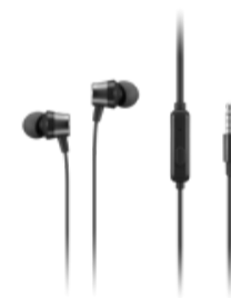
Lenovo Analog In-Ear Headphones Gen II Bulk Package (20pcs)