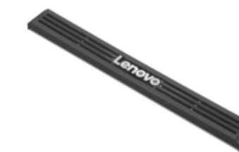
ThinkCentre Tiny Dust Shield Gen6