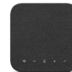
Lenovo Wireless Speakerphone 6000