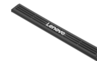
ThinkCentre Tiny Dust Shield Gen6