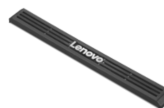
ThinkCentre Tiny Dust Shield Gen6